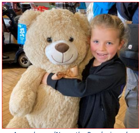
A very happy 'Name the Bear' winner!

Rubery), to Blue Cross charity for the dog show and to everyone who turned up to support the day.